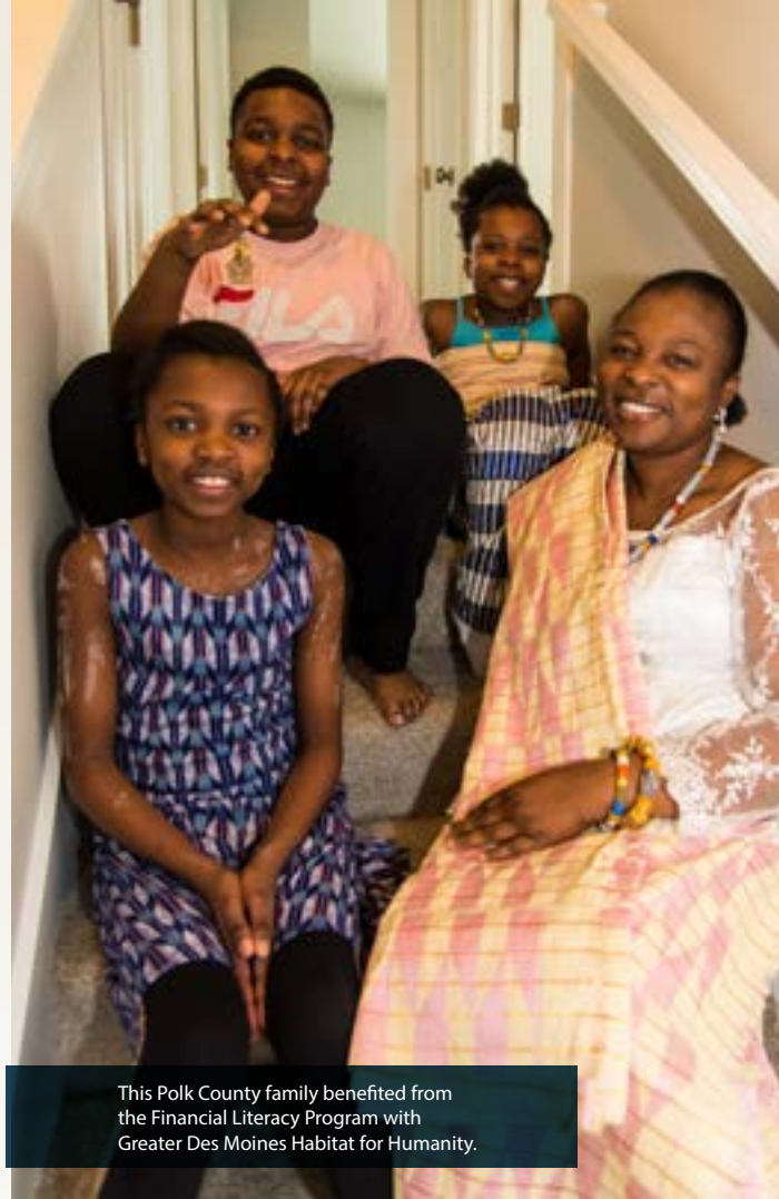
This Polk County family benefited from the Financial Literacy Program with Greater Des Moines Habitat for Humanity.