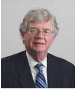
E.J. Giovannetti Chair